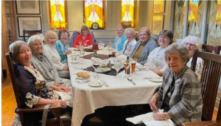
School lunches were never this much fun or tasty!

Luncheon Ladies: The Luncheon Ladies went to The Olde School House in Brantford on Friday April 24. There were 11 members who enjoyed a relaxing delicious lunch with great service. Remember to check out the sign-up sheets as this group will continue to enjoy the best of the region throughout the summer.