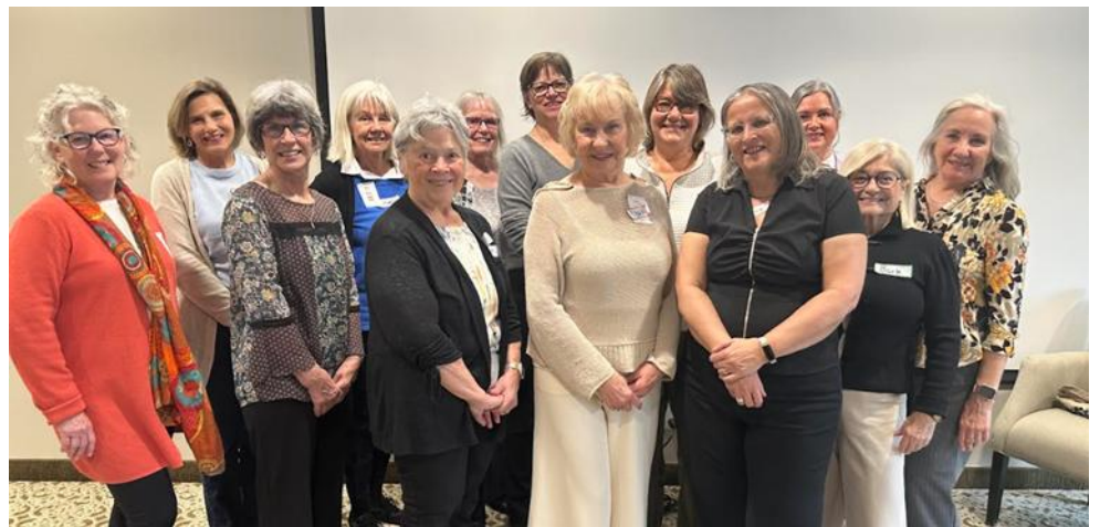
We are so happy to be a part of Probud!

On Thursday, April 9th at Seasons in Cambridge, the newer members of Probud joined the Management and Committee Team members to learn a bit more about all the fun activities that make Probud such a lively organization.