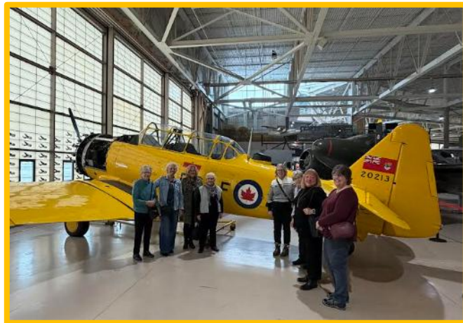
Culture Club ready to take off.

Hiking Club: February 26, was a perfect day for a hike and a little bird watching on the side.