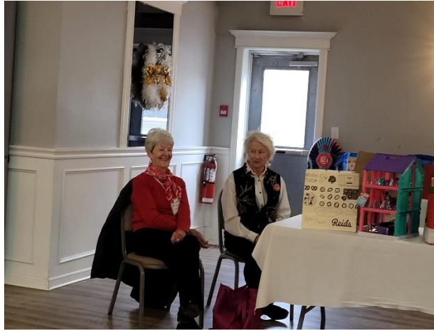
our Toy guardians!