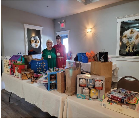
Toy Drive, great success